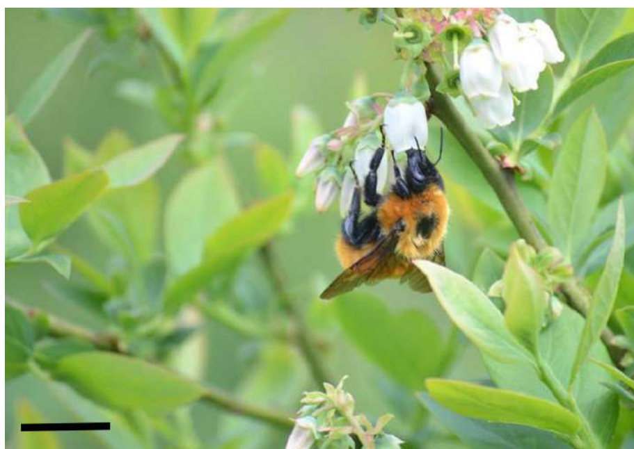
Figure 3. Giant bumblebee: Bombus dahlbomii (Hymenoptera), native from Chile and Argentina, legitimately visiting blueberry flowers in November 2015, Villarica, X Region, Chile (scale: 1 cm). This species has been categorized as “endangered” by the IUCN Red List.

External biotic inputs in Chile are already impacting the environment; the main exotic bumblebee species commercially used for providing pollination services, the buff-tailed bumblebee Bombus terrestris Linnaeus, 1758 and B. ruderatus Fabricius, 1775 have rapidly replaced the Patagonian giant “moscardón” bumblebee Bombus dahlbomii Guérin-Ménéville, 1835 [225–229] (Figure 3). B. dahlbomii was a source of medicinal honey and considered a sacred being by Mapuche, one of the First Nations people of Chile [230]. Scientists have demonstrated that introduced bumblebee species are displacing native B. dahlbomii in Chile and Argentina, colonizing natural areas in most of the southern cone of South America, and have urged authorities to ban the imports of these IA-managed pollinators [231,232]. Even though this is a concerning situation, government policy still allows the importation of buff-tailed bumblebees for IA crop pollination in Chile [231].